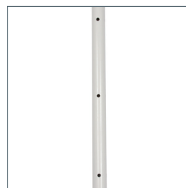
Additional holes allow pole to be cut to desired length