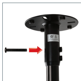
Supplied with safety bolt for a secure installation