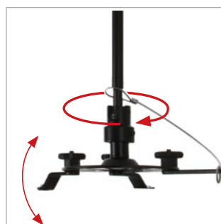
Ball joint adjustment for easy positioning of projector