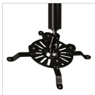
Unique 'carousel' mounting plate for universal compatibility