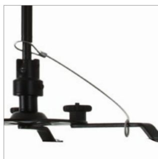
Steel safety wire for extra security