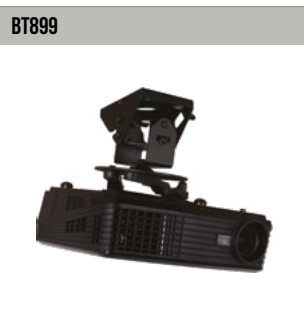
Projector Mount with Micro-Adjustment for projectors up to 25kg