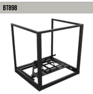
Stackable Heavy Duty Projector Mount designed for projectors up to 75kg