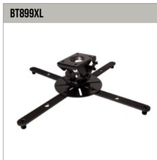
Extra-Large Projector Ceiling Mount for large projectors up to 25kg