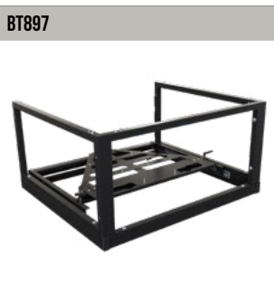
Stackable Heavy Duty Projector Mount designed for projectors up to 75kg