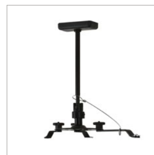
Extra rod supplied for increased ceiling drop