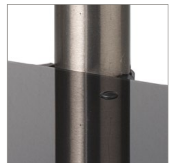
Attaches directly to the BTF800 and BTF801 Poles