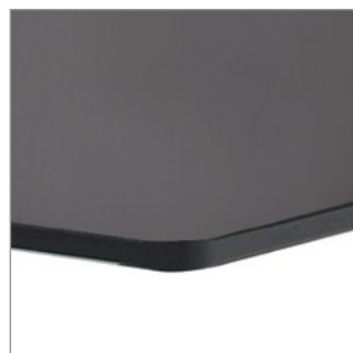
Glass shelf thickness: 6mm