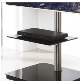
Designed for holding AV equipment such as DVD, Blu-ray® players and game consoles