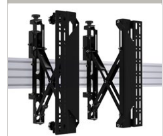
VESA 400 Pop-In, Pop-Out Interface Arms mount medium - large sized video wall screens to BT8390 mounting rails and allow easy access for servicing and maintenance