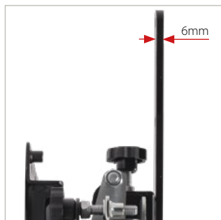
Adaptor arms are ultra-slim to keep the depth of the install to a minimum