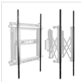
Can be used with a large variety of existing B-Tech products such as the BT8310, BT8311 and System X™ Interface Arms