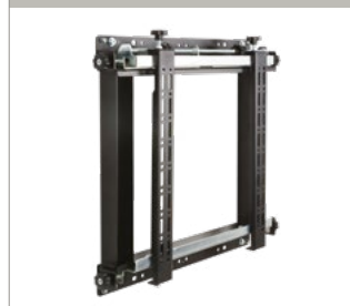
Professional Video Wall Mount for screens up to 75kg (per screen)