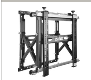
Pop-In, Pop-Out Video Wall Mount for screens up to 75kg (per screen)