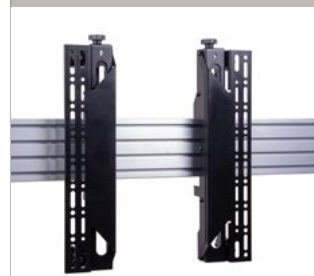
VESA 400 Interface Arms with Micro-adjustment mount medium - large sized video wall screens to BT8390 mounting rails