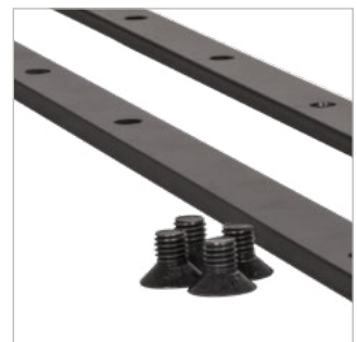
Easily fixes onto interface plates / arms using the screws provided