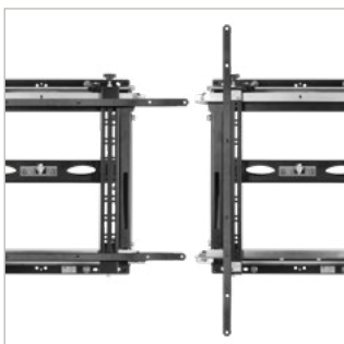
Can be used to accommodate both landscape and portrait installations