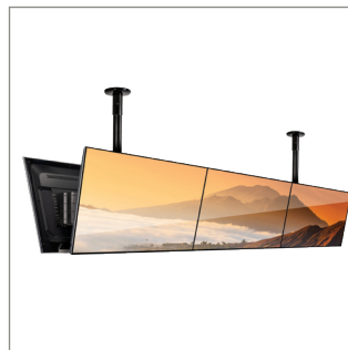
Suitable for landscape, portrait and back-to-back mounting