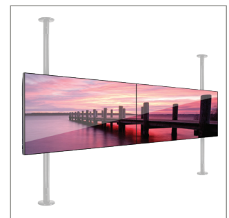
Can also be mounted from the ceiling or in floor-to-ceiling configurations