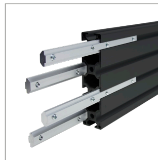
Multiple rail lengths available (rails can also be joined to create larger installs)