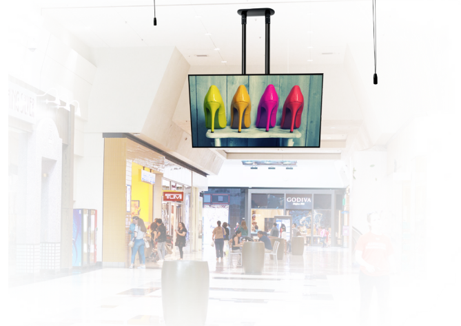
Available in 4 pole lengths**