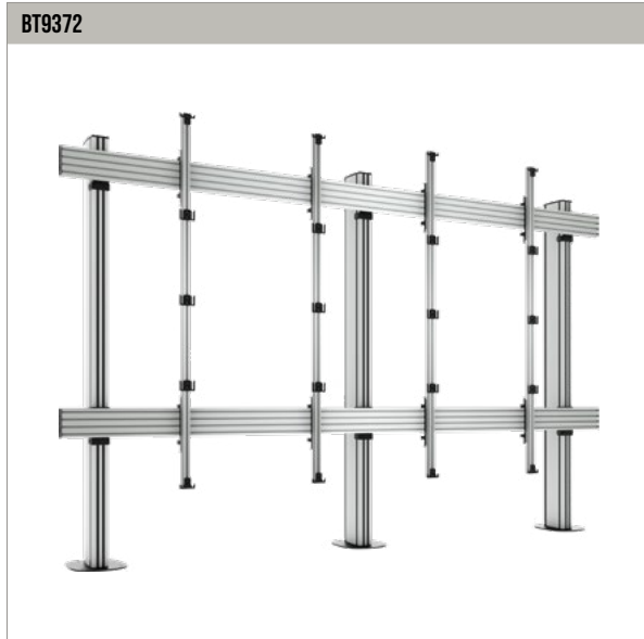
BOLT DOWN UNIVERSAL DIRECT VIEW LED VIDEOWALL STAND