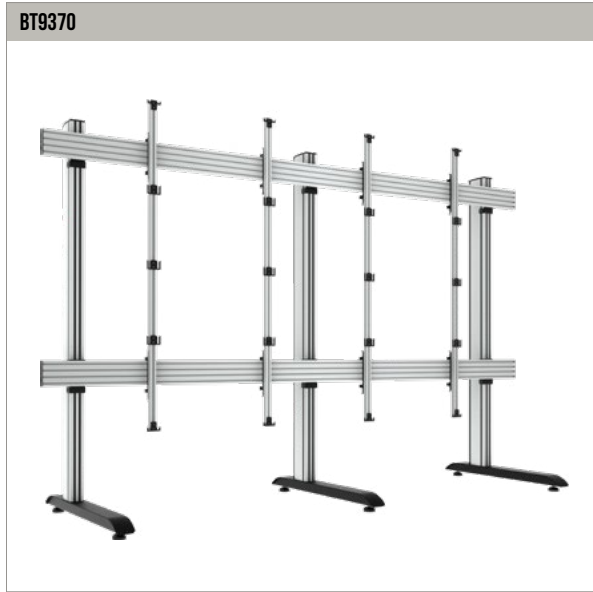
FREESTANDING UNIVERSAL DIRECT VIEW LED VIDEOWALL STAND