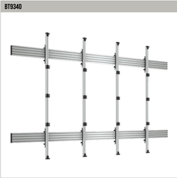
UNIVERSAL DIRECT VIEW LED VIDEOWALL MOUNT