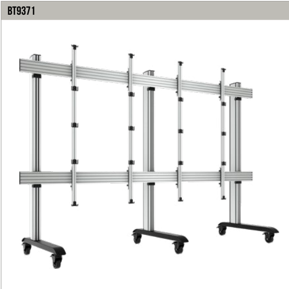
MOBILE UNIVERSAL DIRECT VIEW LED VIDEOWALL STAND