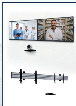
VC WALL KIT 1

Twin Screen VC Wall Mount for screens from 19" - 47" Max load: 70kg per screen Max shelf load: 4kg