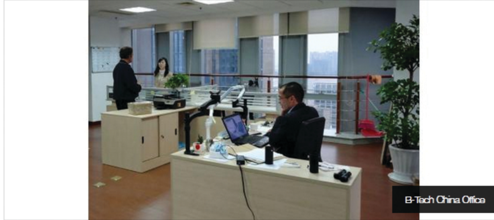
B-Tech China Office